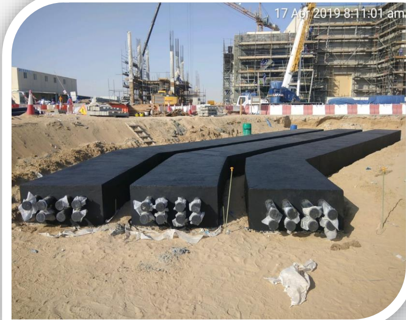
J-581, Client : DEWA (18.6 Kms RL)

Project Description: Supply, Installation, Testing & Commissioning of 132KV Cable laying works for TOWNHOME, DXBHILS, FUNLAND, SAQREMRT, SUNDOS & SEIFDERA 132/11KV Substations & GRNLMTRO, REDLMTRO & DXBMTRO 132/33KV Substations and Associated works (Section-F).