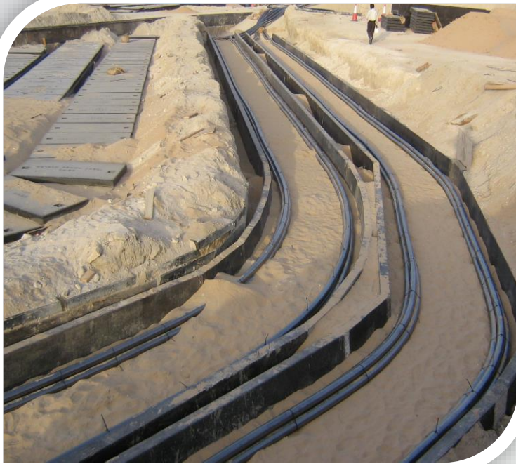
J-607 Client: DEWA (1.45 Kms RL Cable Length – 8.70 Kms )

Project Description: Supply, Installation, Testing & Commissioning Of 132kv Cable Works For New Citywalk-khazan 132kv Cable Circuit And Associated Modification Works (Section –B).