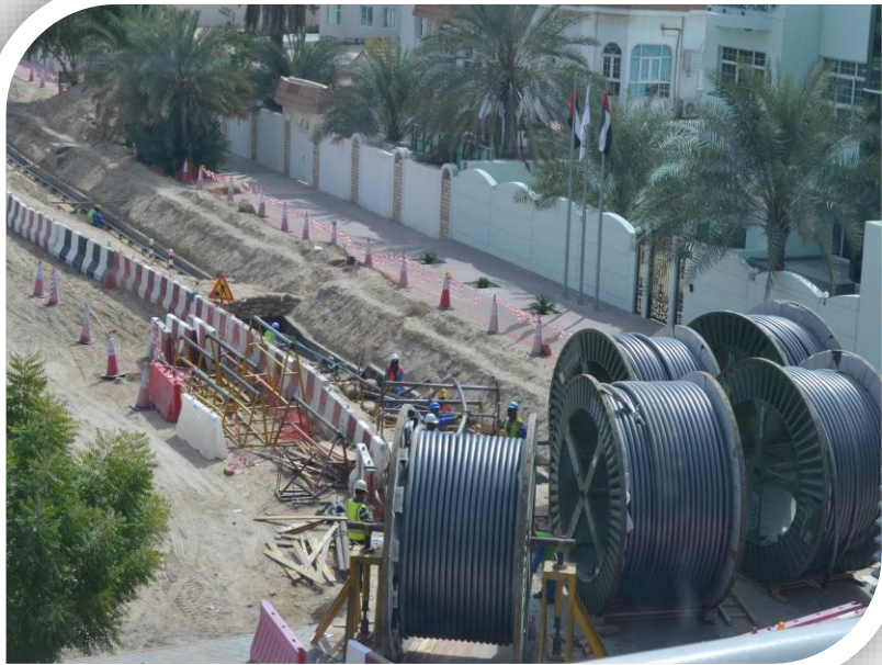
J-567, Client : DEWA (58 Kms RL)

Project Description: Supply, Installation, Testing & Commissioning of 132kV Cable laying works for QUASIS, FRSTKWNJ, ESKNAWIR, IBNBATML, NADSHBRD, PRFRMVLG, WRSNACMD, QUSSINDS & RSHDPORT 132/11kV Substations and Associated Works