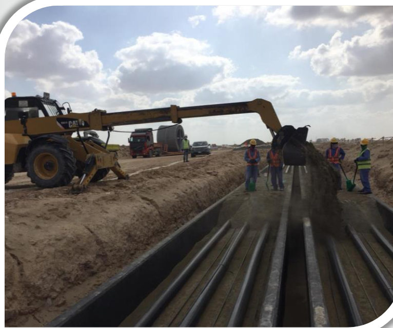
J-584 Client : NOOR ENERGY (69 Kms RL)

Project Description: Supply, Installation, Testing & Commissioning Of 132kv Cable Works For New Citywalk-khazan 132kv Cable Circuit And Associated Modification Works (Section –B).