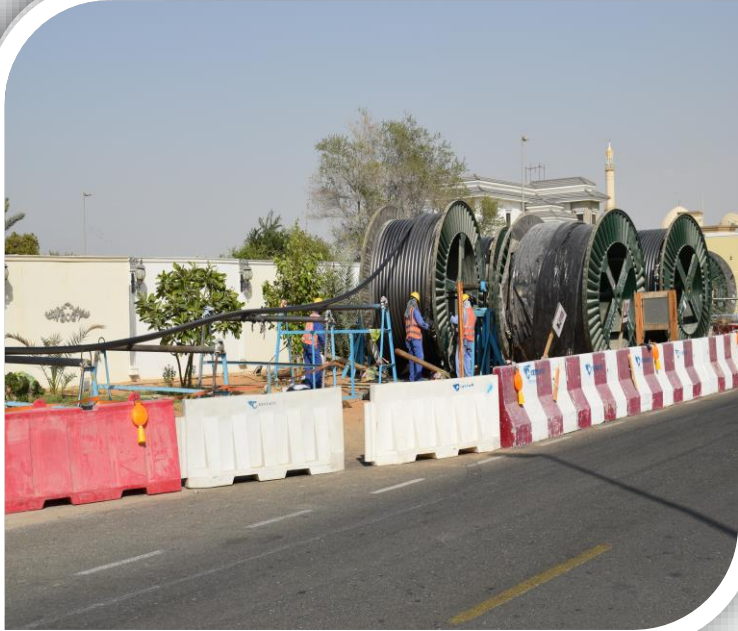
J-610 Client : DEWA (7.40 Kms RL ,Cable Length – 44.40 Kms )

Project Description: Supply, Installation, Testing & Commissioning Of 132kv Cable Works For VALLEY 132kv Cable Circuit And Associated Modification Work(Section – E).