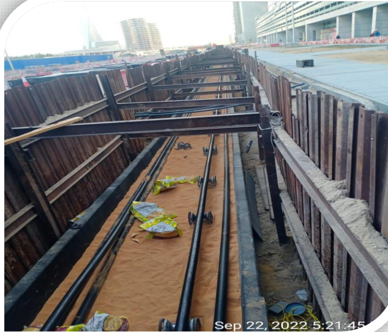
J-609 Client: DEWA (9.10 Kms RL & Cable Length – 54.60 Kms)

Project Description: Supply, Installation, Testing & Commissioning Of 132kv Cable Works For VALLEY 132kv Cable Circuit And Associated Modification Work(Section – E).