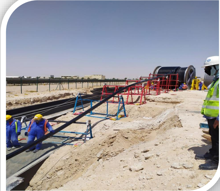
J-608 Client: DEWA (8.50 Kms RL & Cable Length – 51 Kms)

Project Description: Supply, Installation, Testing & Commissioning Of 132kv Cable Works For SRAYATST 132kv Cable Circuit And Associated Modification Works (Section – D).