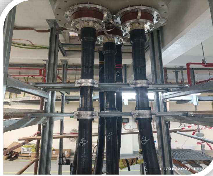
J-561, Client : DEWA (12.10 Kms RL)

Project Description: Supply, Installation, Testing & Commissioning of 132kV Cable laying works for QUASIS, FRSTKWNJ, ESKNAWIR, IBNBATML, NADSHBRD, PRFRMVLG, WRSNACMD, QUSSINDS & RSHDPORT 132/11kV Substations and Associated Works